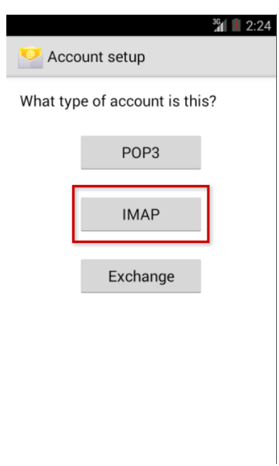
The account type selection screen