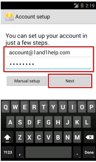
The basic settings screen